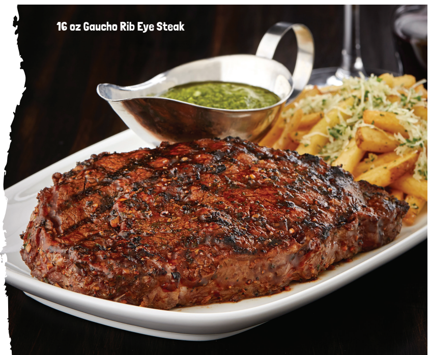
16 oz Gaucha Rib Eye Steak