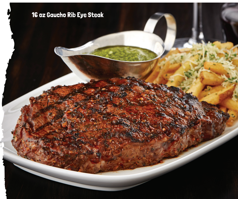
16 oz Gaucha Rib Eye Steak